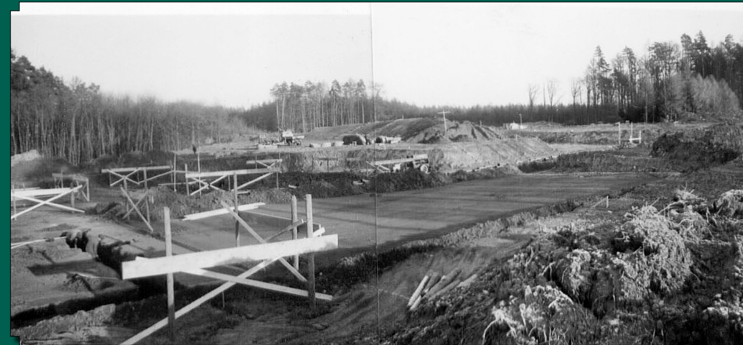
Charlie Section Emerges