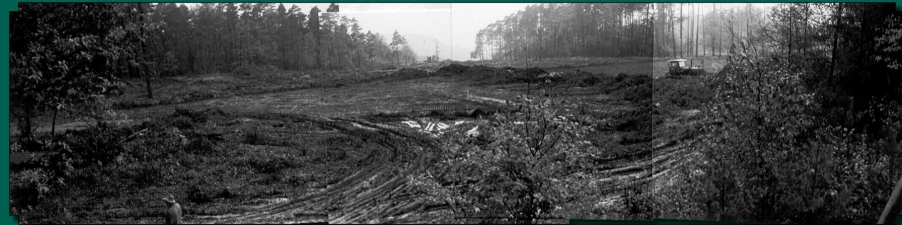
The Clearing Continues