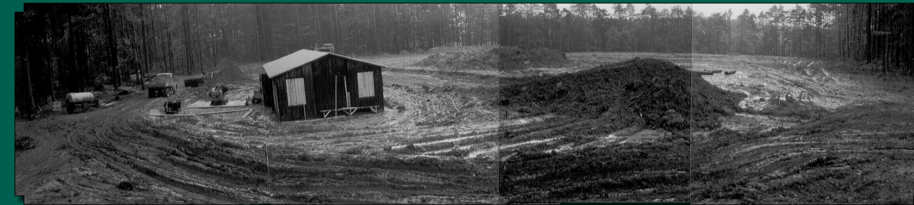
OK Let's Get Started