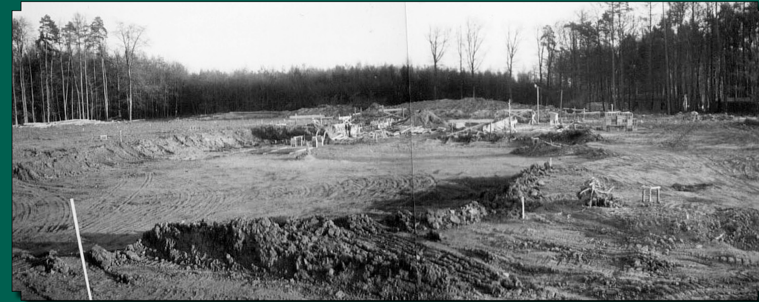
Alpha Section Emerges