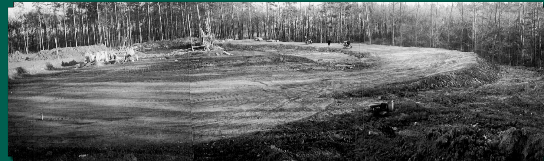
Bravo Section Emerges