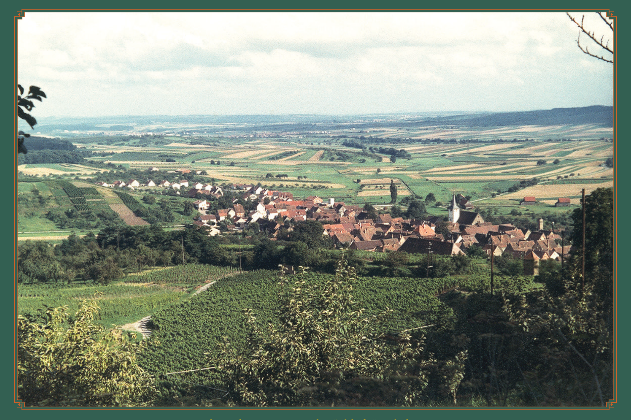
The Zabergäu From The Schloß Stocksberg

This is a wonderful panorama of The Zabergäu, with the village of Stockheim below. Actually this photo shows only part of the valley. If you refer to the detail map you will see it really starts around to the right and back to Zaberfeld. We can see, up and a little to the left of center, the city of Brackenheim. Then, a little further in the distance and to the right, is Lauffen am Neckar. The villages to the left of Brackenheim are probably Dürrenzimmern and Nordhausen. The high hills to the right is The Stromberg, and defines the other side of the valley opposite the Heuchelberg.