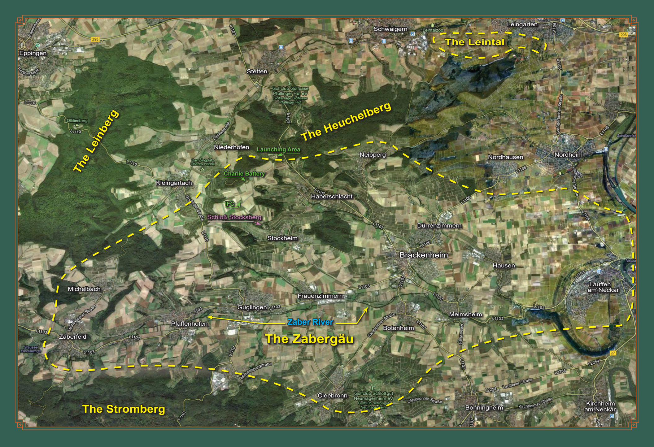
The Zabergäu And The Leintal Detail Map