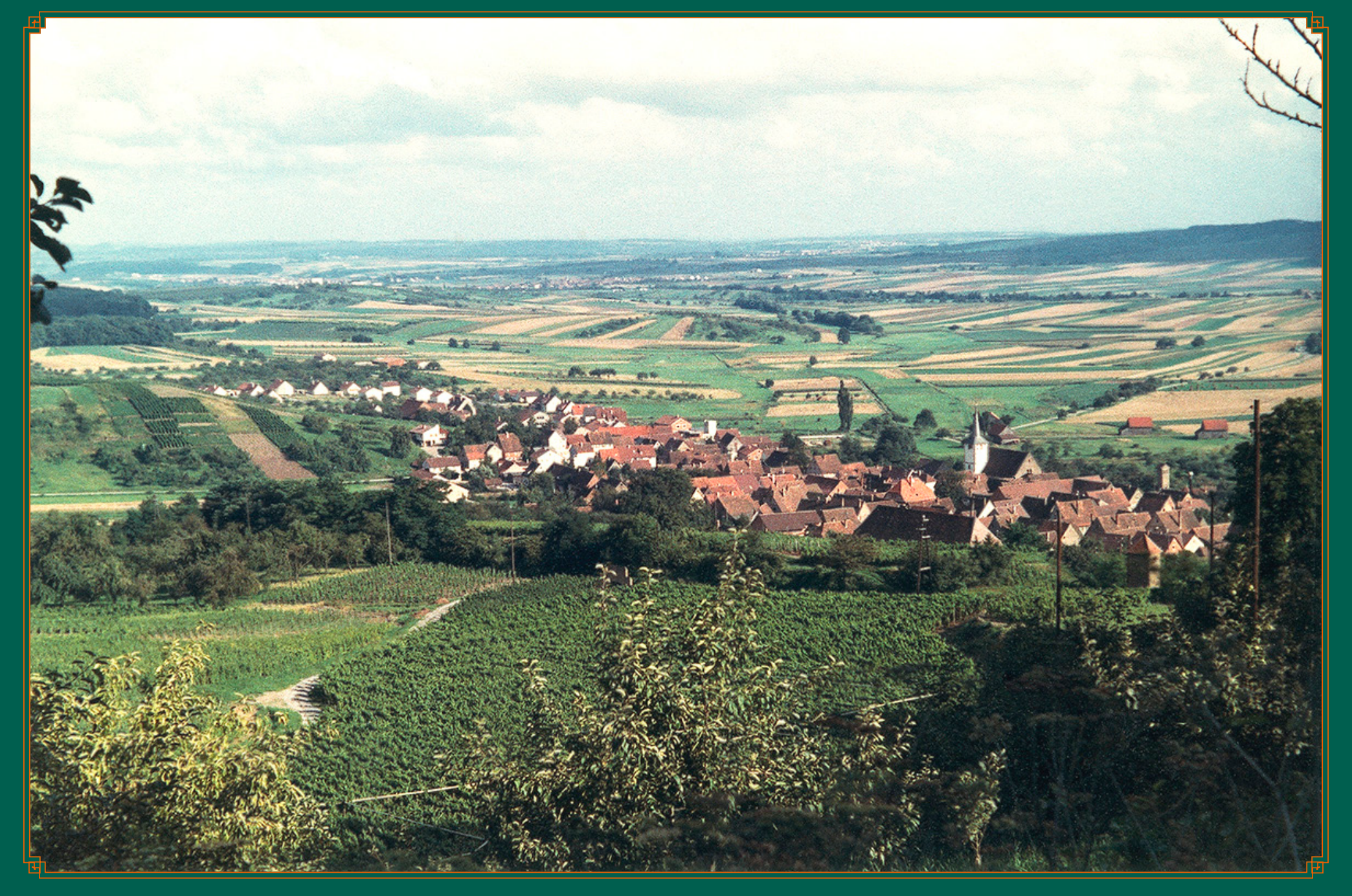
The Zabergäu From The Schloß Stocksberg

This is a wonderful panorama of The Zabergäu, with the village of Stockheim below. Actually this photo shows only part of the valley. If you refer to the detail map you will see it really starts around to the right and back to Zaberfeld. We can see, up and a little to the left of center, the city of Brackenheim. Then, a little further in the distance and to the right, is Lauffen am Neckar. The villages to the left of Brackenheim are probably Dürrenzimmern and Nordhausen. The high hills to the right is The Stromberg, and defines the other side of the valley opposite the Heuchelberg.