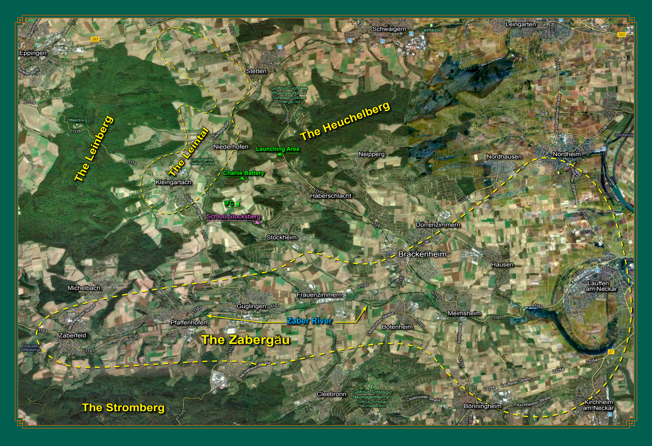
The Zabergau And The Leintal Detail Map